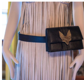
红酒做成的纯素皮革 Vegan Leather made from Wine