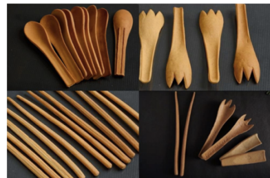
可以吃的餐具 Edible Cutlery