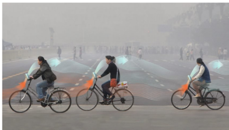
除霾单车 Smog Free Bicycle

How can you be an "Actor of Change" in your daily life?