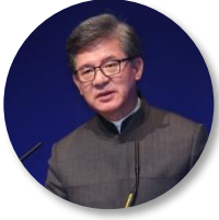
罗康瑞 Vincent Lo 香港贸易发展局主席瑞安集团主席 Chairman, Hong Kong Trade Development Council (HKTDCC) and Chairman, Shui On