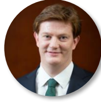
Sir Danny Alexander 爵士 亚洲基础设施投资银行副行长兼董事会秘书长 Vice President and Corporate Secretary, Asia Infrastructure Investment Bank(AIIB)