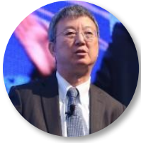
朱民 Zhu Min 博士, 清华大学国家金融研究院院长, 原国际货币基金组织 (IMF) 副总裁 Former IMF Vice President and President, National Institute of Finance