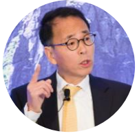
谢国忠 Andy Xie 博士, 独立经济学家 Doctor, Independent Economist