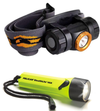
C Headlamp Flashlight