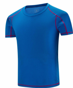
B Base Layer T-shirt