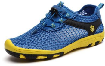
C Water Shoes