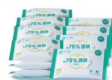
D Tissues and Wet wipes