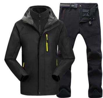
B Outer Layer Jackets and pants