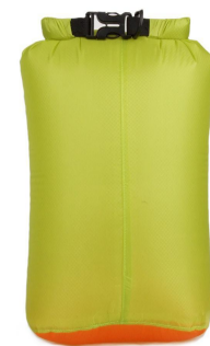
D Water proof storage bags