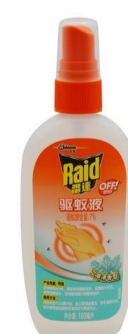
D Mosquito repellent