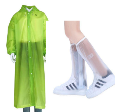
A Rain gear