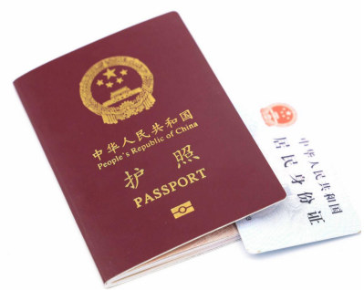
A Personal IDs