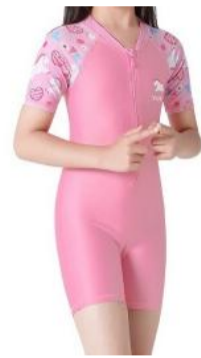
C Water Sport Wear