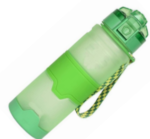
A Sports Water Bottle