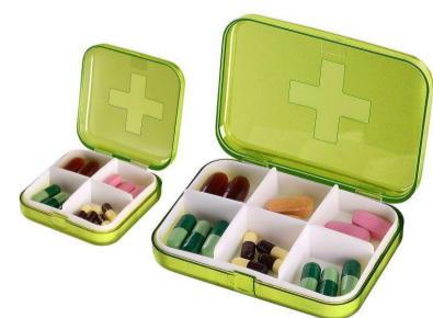
A Personal Medicines